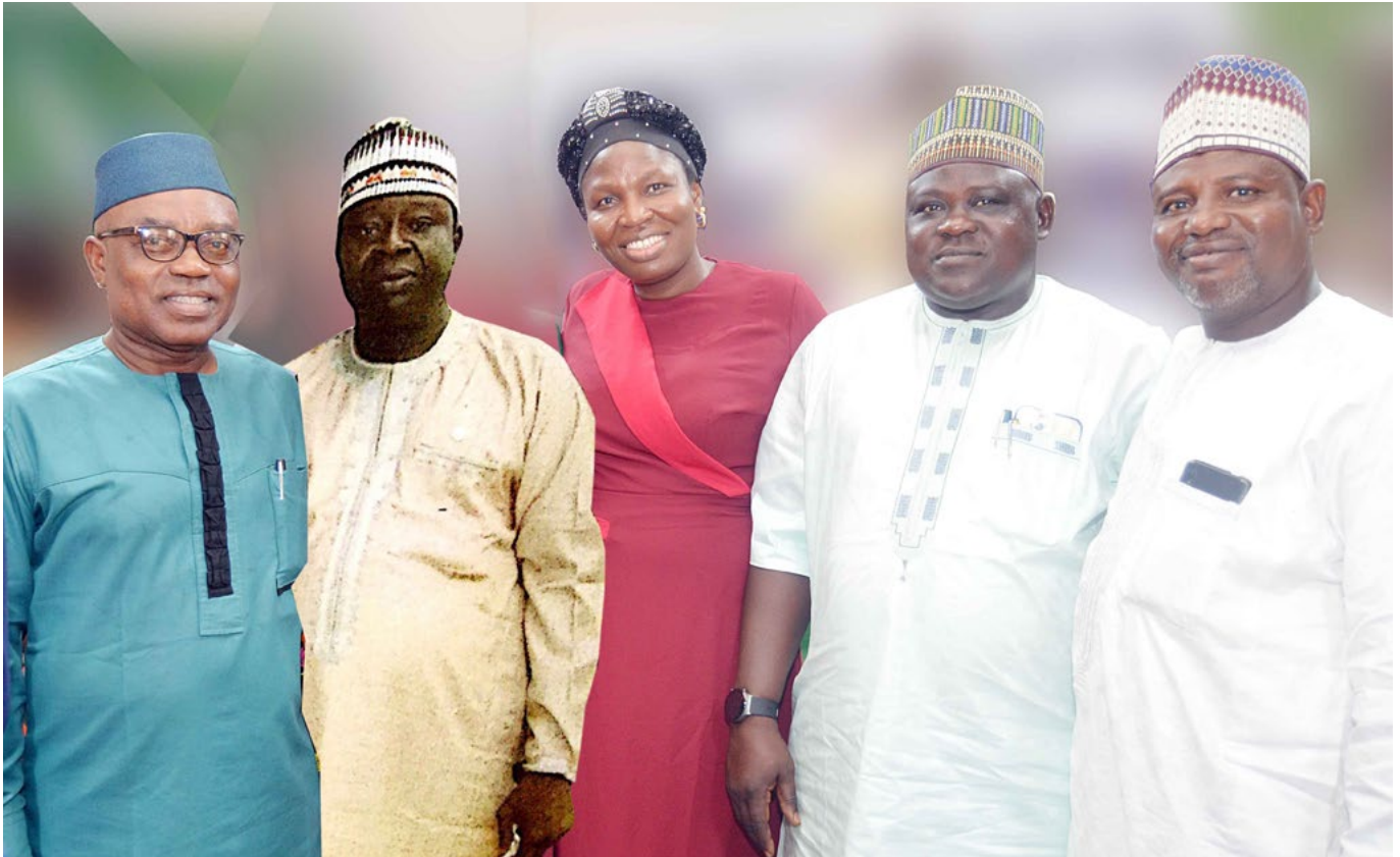
Some Executive Members of the Cooperative