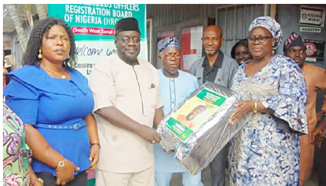
The Registrar being presented with a gift while on a working visit to south-west zonal office, Lagos.