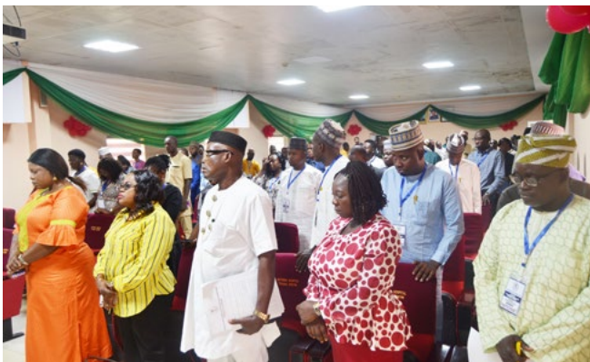
Zonal coordinators at a stakeholders meeting recently at National Hospital, Abuja