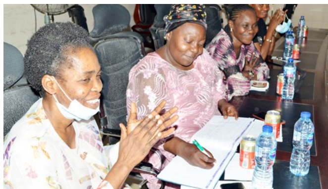
The Association women wing on a courtesy visit to the Registrar