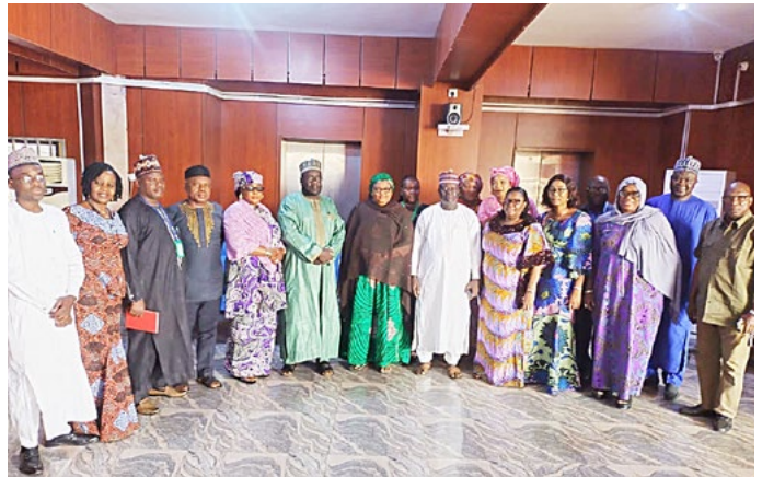
Group photograph at NYSC Headquarters, Abuja