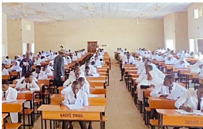
Students writing Board Licensing Re-sit exams in one of the centre recently