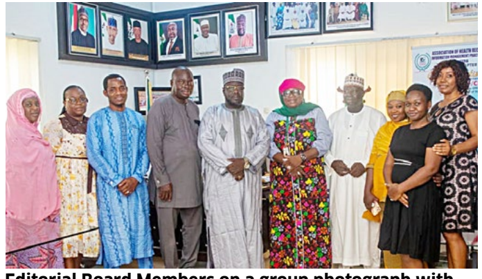
Editorial Board Members on a group photograph with The Registrar