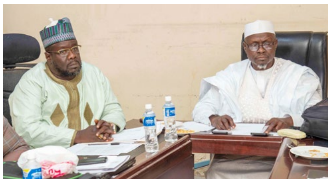
The Board Chairman and The Registrar during a Board meeting