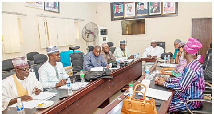
A Cross section of Governing Board Members during Board Meeting