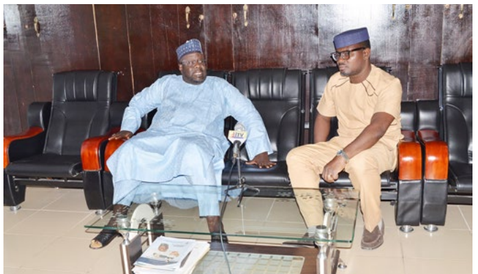
The Registrar during an interview section with ITV