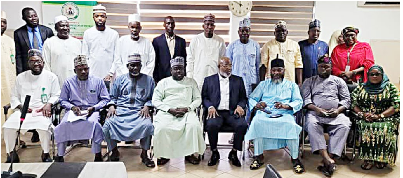
Cross section of HRORBN delegation led by the Registrar to National Hajj Commission of Nigeria at the Hajj House, Abuja