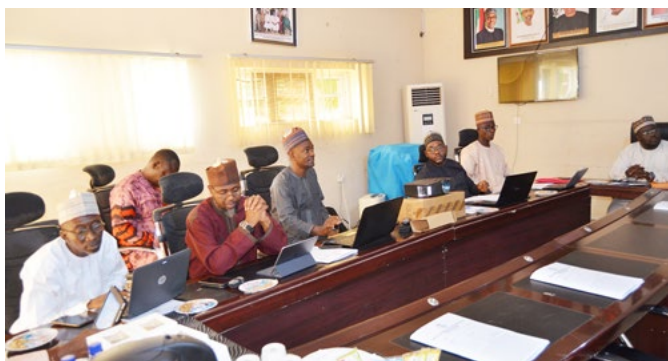
Delegates from Kad Poly on the occasion of train-the-trainers presentations.