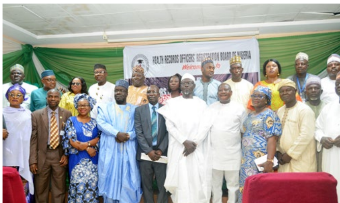
Board members and top management staff during stakeholders retreat recently